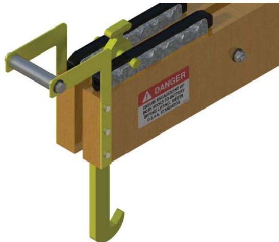
BATTERY LIFTING BEAM HANDLE AS INSTALLED